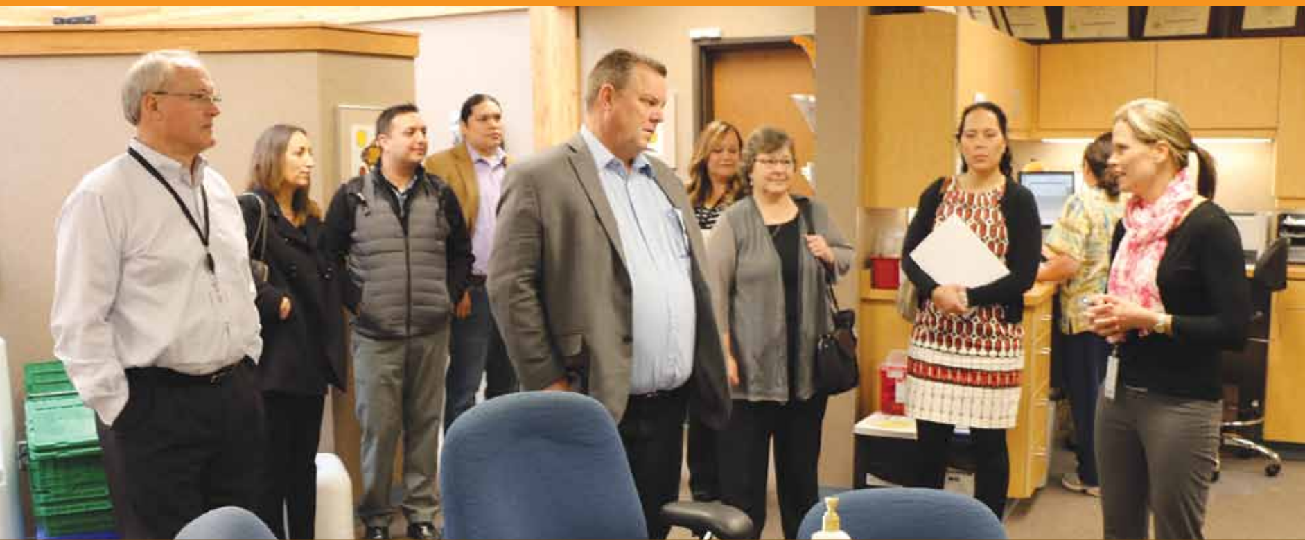
Senator Jon Tester (D-MT), visits the Fond du Lac Reservation.